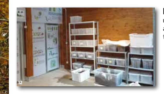
Ex situ conservation - The Hermit beetle is bred in three centres set up for the reproduction of the species. The larvae and adults produced are used to populate the wood mould boxes placed in nature or hollowed trees

Reintroduction in nature - To encourage the expansion of the distribution areas of the saproxylic and aquatic insects (Hermit beetle, Water beetle an Southern damselfly) action is taken to reintroduce the species in suitable locations using specimens taken from healthy source populations or from established breeding centres. For example to promote the expansion of the distribution areas of the Southern damselfly, specimens of this species are moved from sites where they are present to distant sites in need of repopulation or numerical increase, thus allowing a greater dispersion of the species.